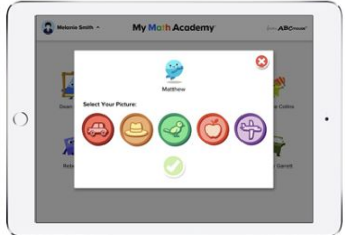
First time student login